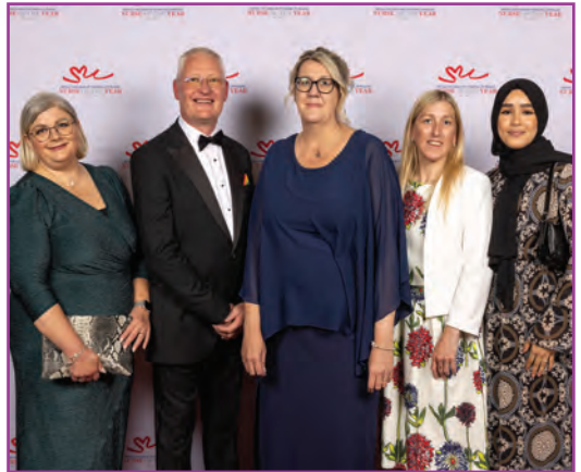
RCN Prince of Wales Nursing Cadets