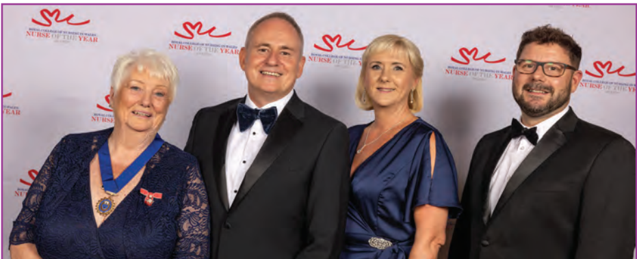
Cwm Taf Morgannwg University Health Board