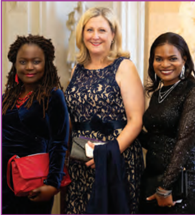
Swansea Bay University Health Board