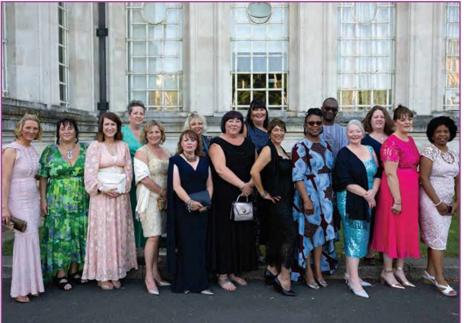
Hywel Dda University Health Board