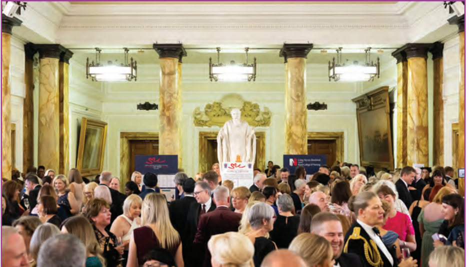
Welcome reception sponsored by Fieldbay

Back at City Hall in Cardiff for the 10th celebration of the RCN Wales Nurse of the Year Awards. Our first in person event since 2019.