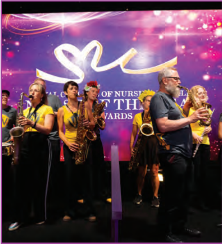
Wonderbrass announce the start of the ceremony in style.