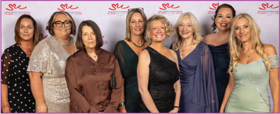
Tŷ Hafan Children's Hospice