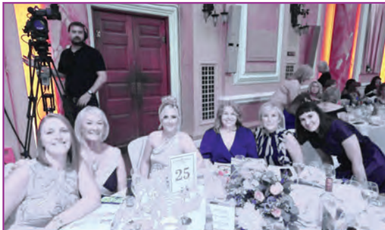
Previous RCN Wales Nurse of the Year award winners.