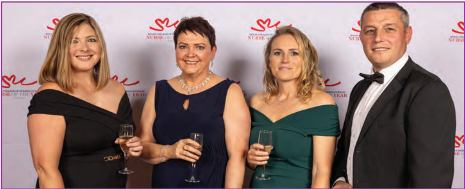
Betsi Cadwaladr University Health Board