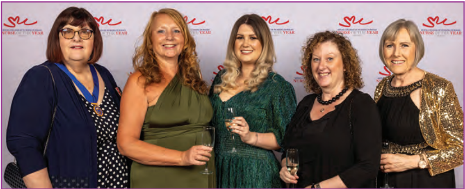
Velindre University NHS Trust