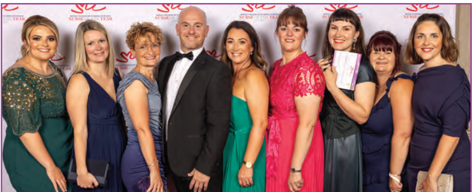
Cardiff and Vale University Health Board