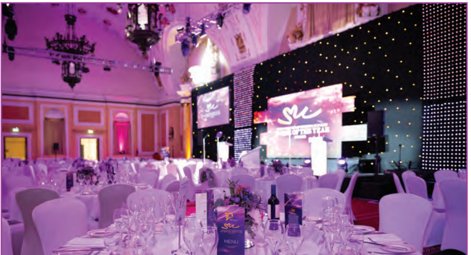
Awards ceremony hall decorated to the nines